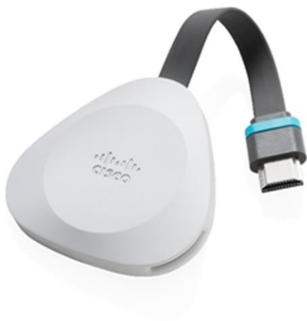
Figure 1. Cisco Webex Share

Cisco Webex Share complements the premium portfolio of Cisco Webex collaboration devices, enabling conference rooms and huddle spaces to offer the same Webex user experience as Cisco's video devices.