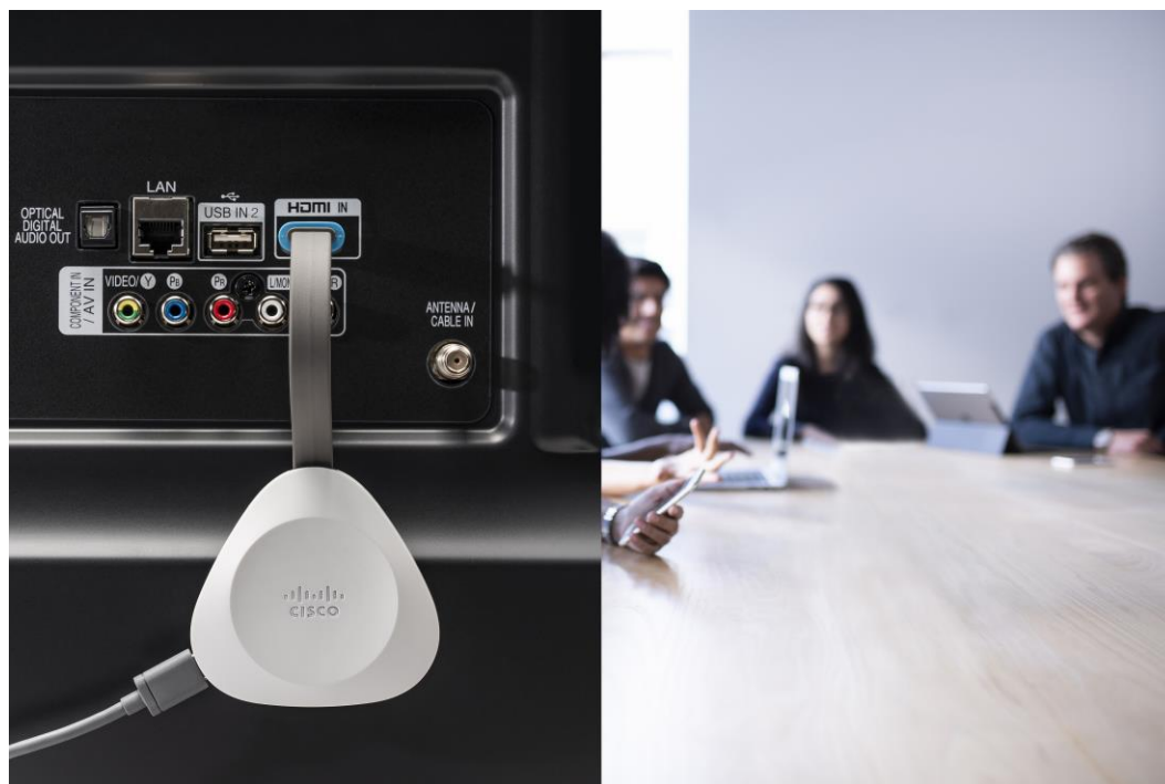
Figure 3. Webex Share installation

Cisco Webex Share is installed behind the screen (Figure 4). The package includes a cable management sticker that allows users to correctly position the device behind the display and to avoid mechanical stress on the HDMI port. The HDMI cable has been designed to sustain the device weight.